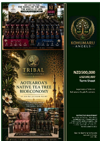
DOC-7001 USD300k (NZD500k) Kohumaru Angels Allocation (ex 7002)