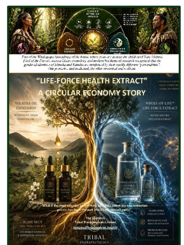
DOC-9001 The Life-Force Health Extract Launch Storybook

ONE STORE + HEALTH BAR | MULTIPLE PRODUCT LINES | MULTIPLE REVENUE STREAMS | POTENTIAL EQUITY-FRANCHISE STRUCTURED EXPANSION.