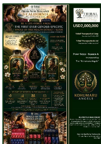
DOC-7002 USD2M (NZD3.3M) SEC Reg D, Rule 504 Restricted Offer