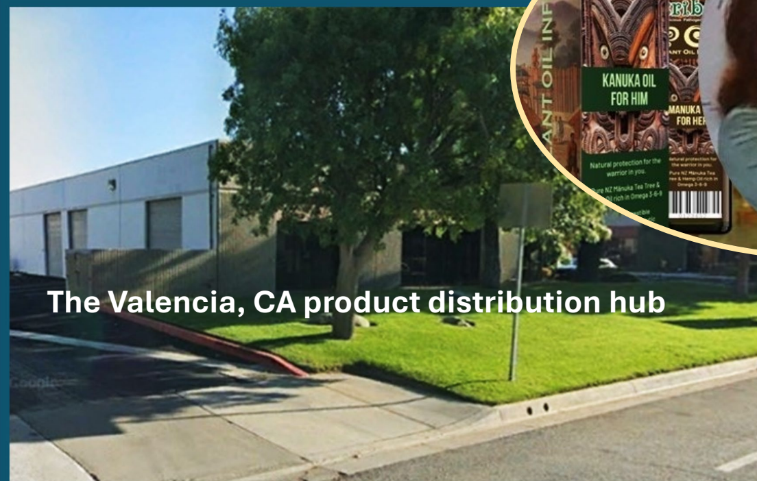
The Valencia, CA product distribution hub