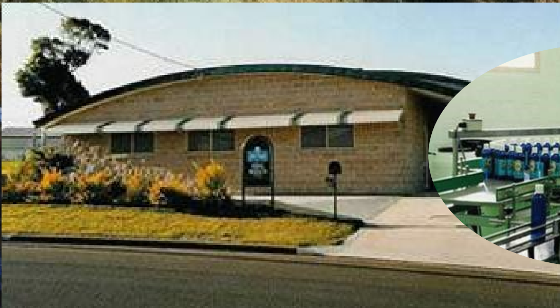
Alstonville facility, Twin Rivers region, NSW

Two GMP TGA compliant, natural healthcare product manufacturing facilities plus a 250 acre farm with modern villa style manager residence plus onsite worker lodging.