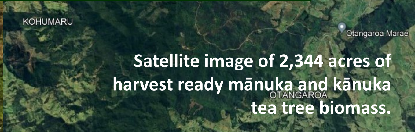
Satellite image of 2,344 acres of harvest ready mānuka and kānuka tea tree biomass.