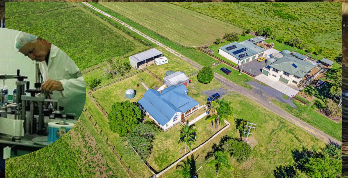
Swan Bay, facility, Northern NSW