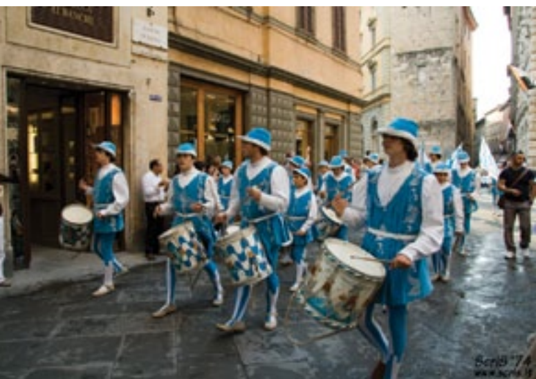
The Onda (Wave) contrada march through the streets on their way to the race. (Cristian Santinon)