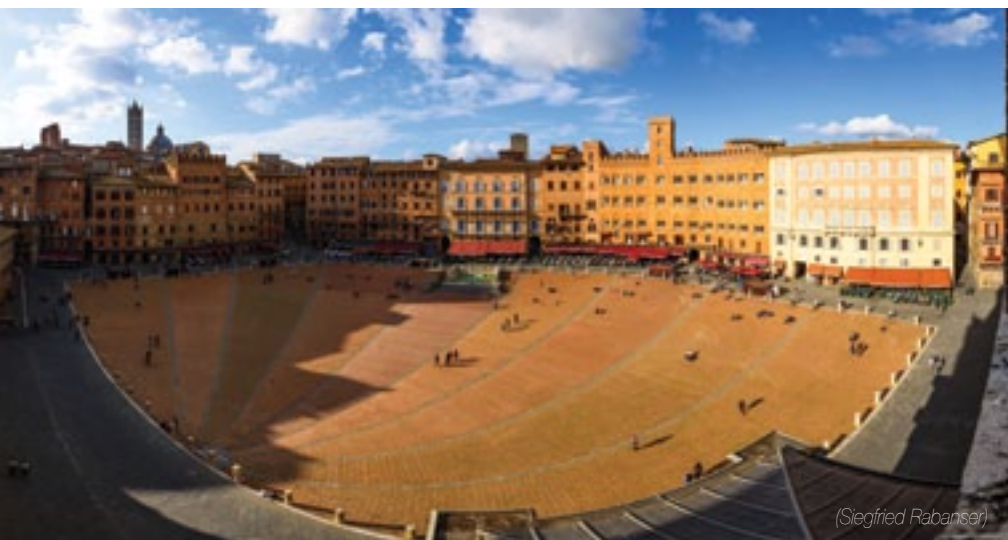
La Piazza del Campo where the race is held twice each summer.