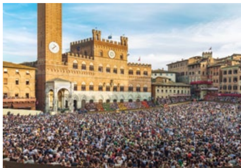
Sixty thousand spectators crowd the stadium for the race while thousands more hang from surrounding windows and balconies. (Cebas)

Their job is to protect the horse at all cost, keep their jockey away from bribes of the enemy contrada, and keep a lid on any situations that might disqualify them.