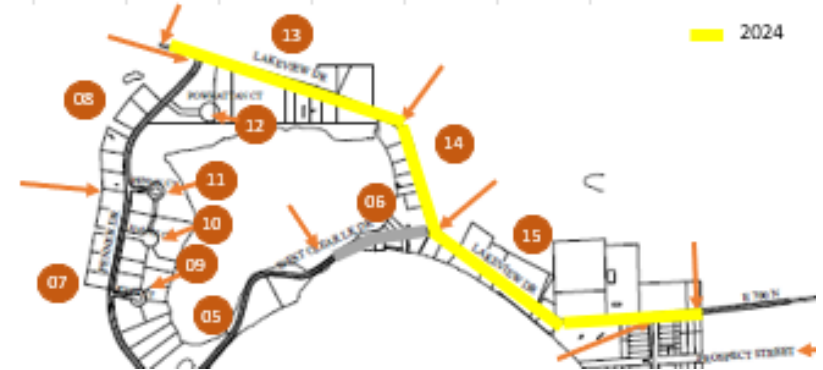
CLEAR LAKE, INDIANA STEBEN COUNTY

2024: Lakeview (Ref. # 13,14,15) Current PASER Rating – 3 (Poor)