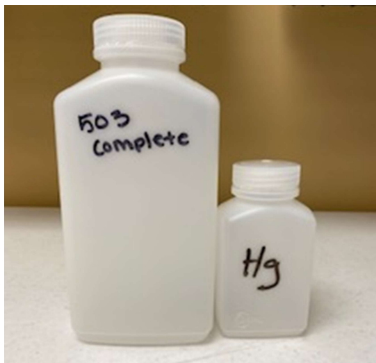
BioSolid 503 Complete + Mercury