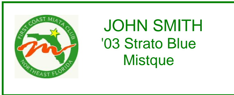
BADGE EXAMPLE #2