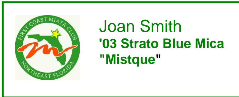
BADGE EXAMPLE #3