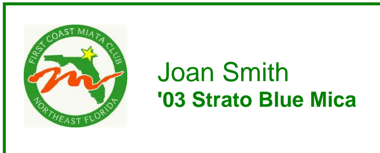
BADGE EXAMPLE #4