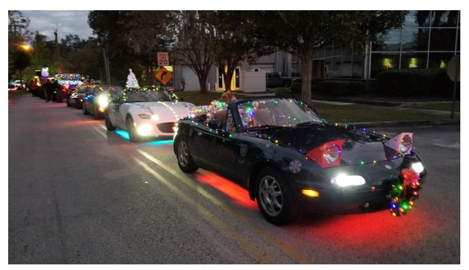
Volume 32, Issue 6

And of course, EVERYONE is welcome to come to the parade and watch!