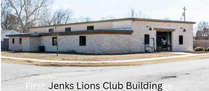
First Jenks Lions Club Building