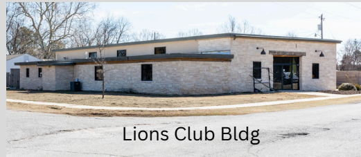
Lions Club Bldg