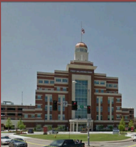
Village on Main