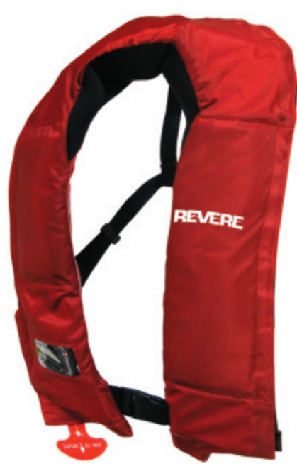
The Revere SportMax 22-pound inflatable PFD is a compact and inexpensive inflatable vest.

"One thing I have discovered about pilots and their survival kits," McGill offered, "is the fact that they tend to forget that their kits need to be renewed or revitalized. What I do is, each year my airplane goes in for its annual, I take my kit out and take care of the necessary updates. I replace all spare batteries, and the batteries in any items that need them. I check all meds to make sure they haven't gotten so old that they are no longer potent, and make sure that all foods stuff is fresh enough to be