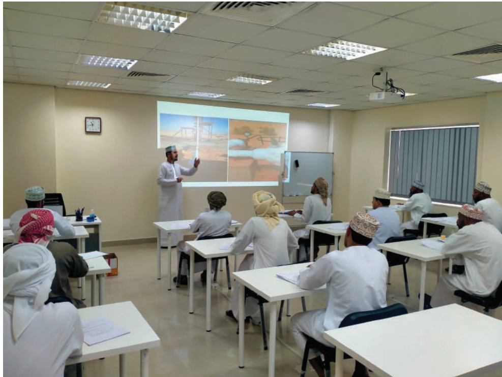
Classroom Based Training