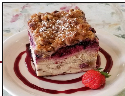
The Breakfast Club's World Renowned Oven Baked French Toast

Layers of Texas toast baked in a rich custard served on caramel sauce and topped with crème anglaise. 11.99