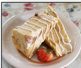
Crème Brulee French Toast

Layers of Texas toast baked in a rich custard served on caramel sauce and topped with crème anglaise. 11.99