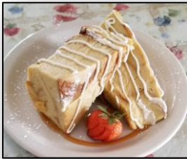
Crème Brulee French Toast

Layers of Texas toast baked in a rich custard served on caramel sauce and topped with crème anglaise. 11.99