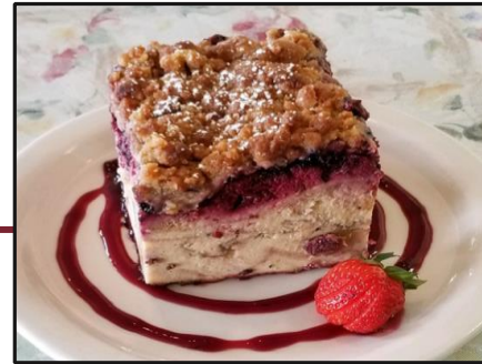
The Breakfast Club's World Renowned Oven Baked French Toast

Layers of Texas toast baked in a rich custard served on caramel sauce and topped with crème anglaise. 11.99