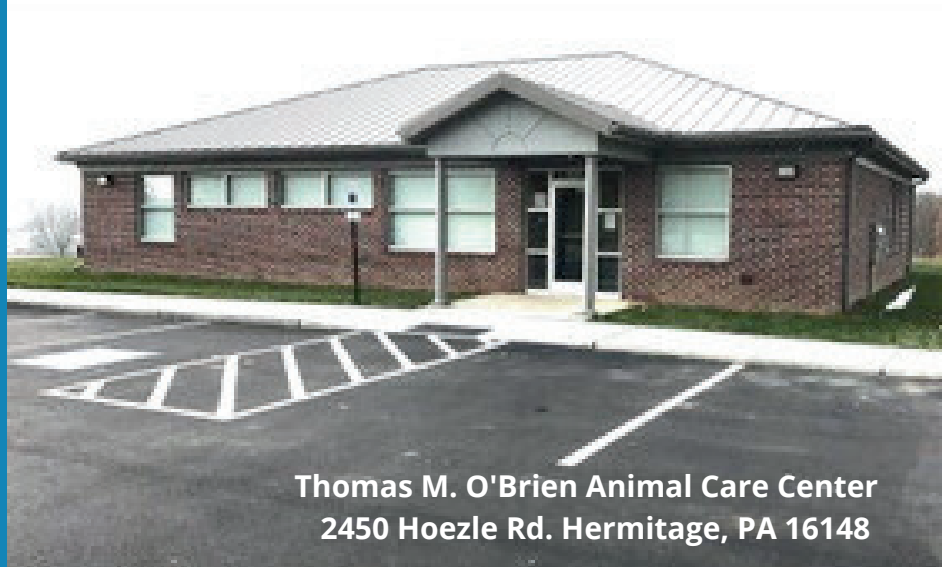
Thomas M. O'Brien Animal Care Center 2450 Hoezle Rd. Hermitage, PA 16148

For More Information about us: TailsofHopeWPA.org