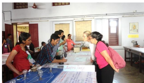
Inquisitive visitors to the Physics Exhibition