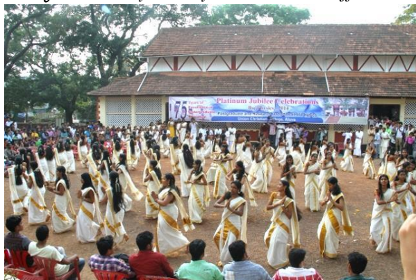
തിരുവാതിര by 75 Physics students/staff