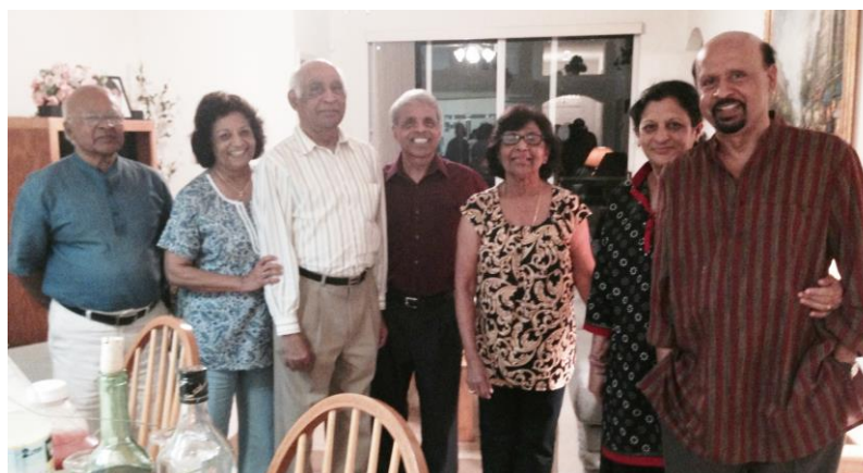
UCCANNA small get-together in Tampa, Florida.