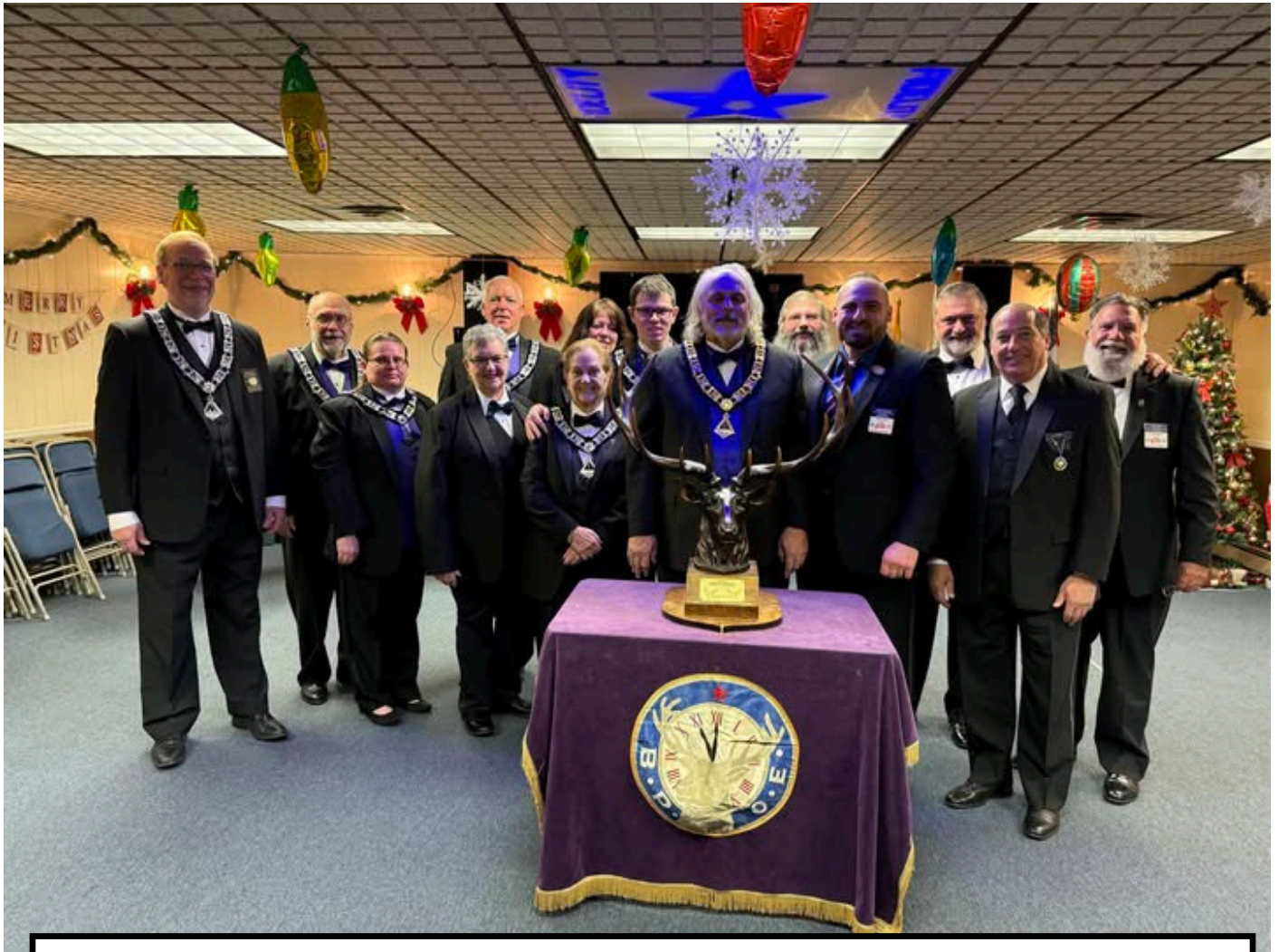
Piscataway Lodge 2414, your 2025-2026 Central District Ritual Team!