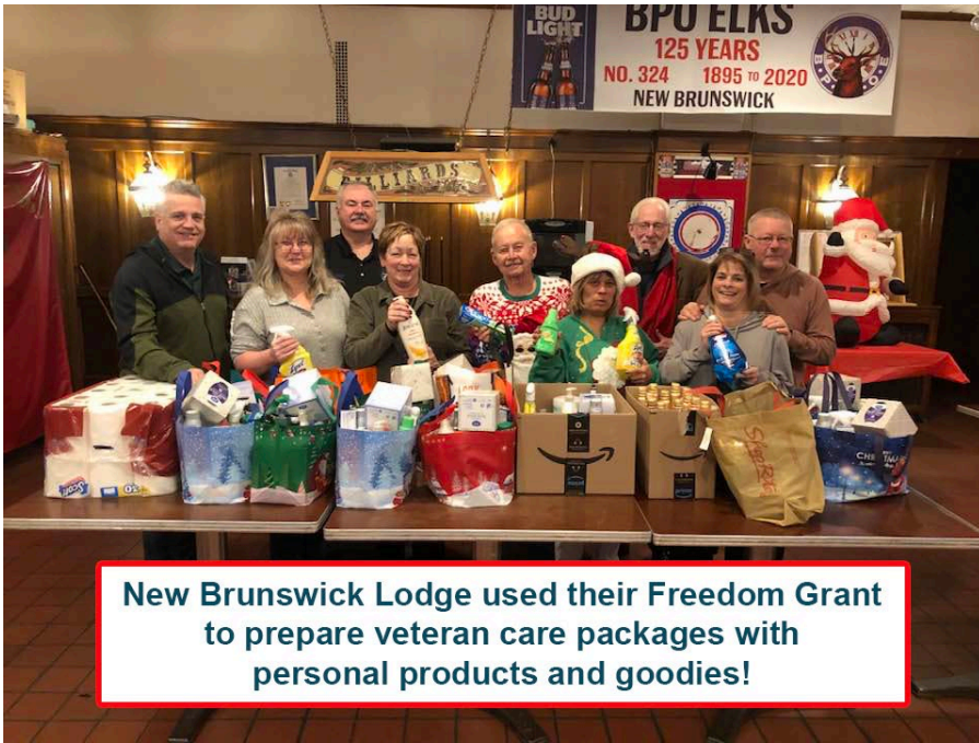
New Brunswick Lodge used their Freedom Grant to prepare veteran care packages with personal products and goodies!