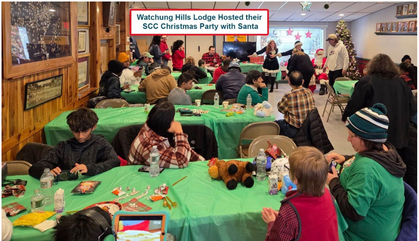
Watchung Hills Lodge Hosted their SCC Christmas Party with Santa