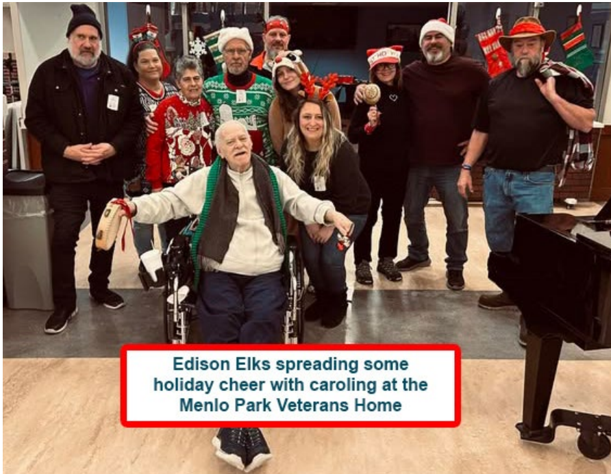
Edison Elks spreading some holiday cheer with caroling at the Menlo Park Veterans Home