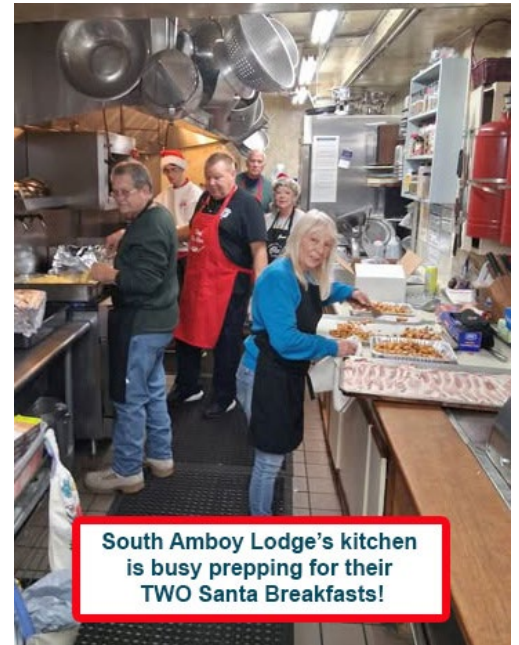
South Amboy Lodge's kitchen is busy prepping for their TWO Santa Breakfasts!