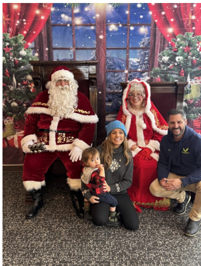
Breakfast With Santa PJ Party