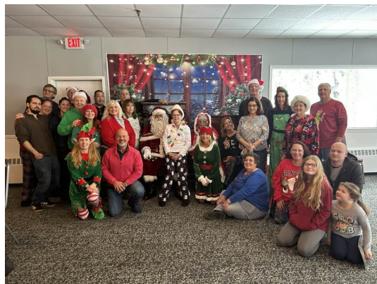
Santa & his elves did a great job!