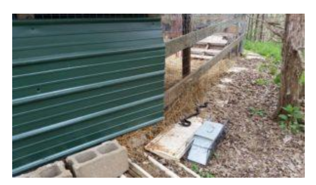
So, why is that snake in your yard (or maybe in your house), anyway?