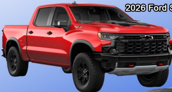
2026 Silverado ZR2