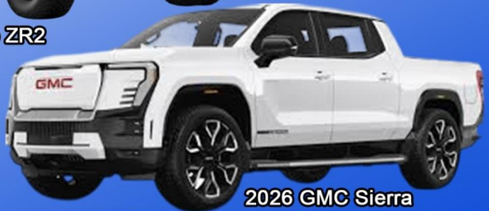
2026 GMC Sierra