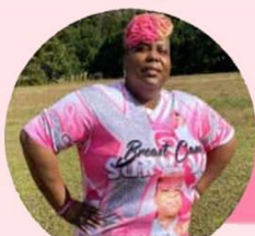
SURVIVOR GUEST SPEAKER