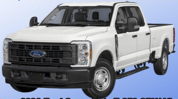
2026 Ford Super Duty F-250 SRW XL