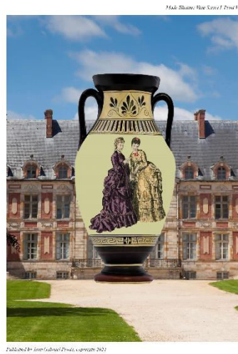
Print with Background