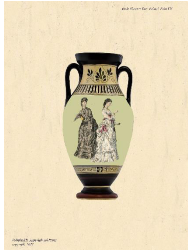
Print with Background