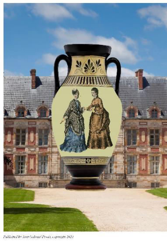
Print with Background