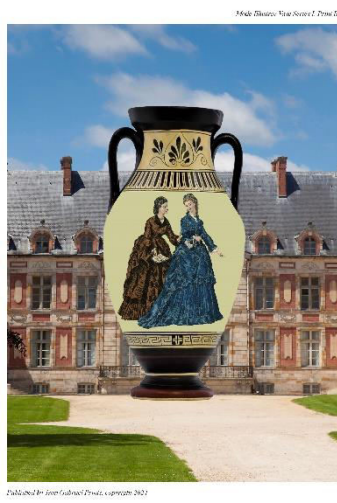
Print with Background