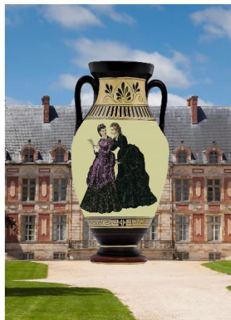
Print with Background