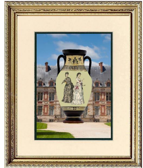
Print with Optional Mat and Frame