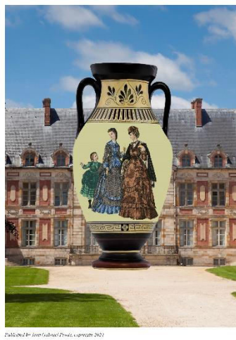
Print with Background