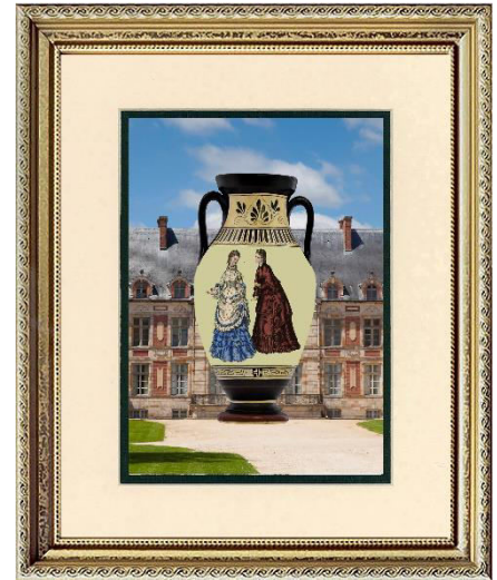
Print with Optional Mat and Frame