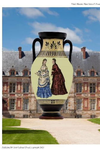
Print with Background