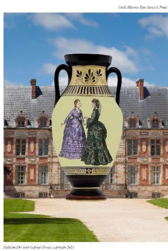
Print with Background