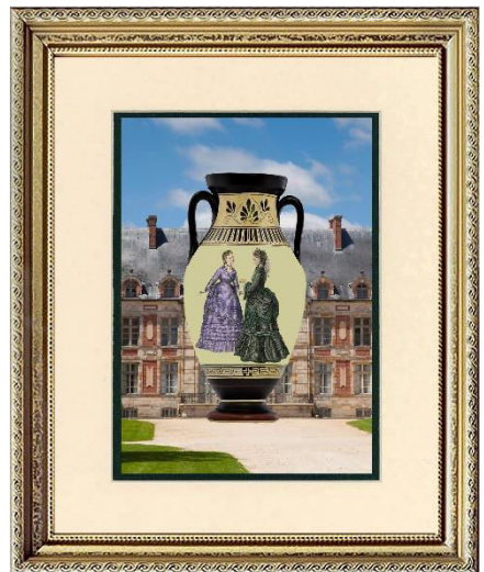
Print with Optional Mat and Frame