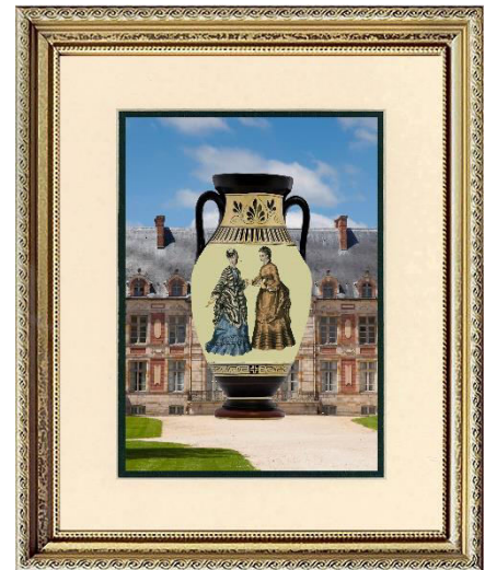
Print with Optional Mat and Frame