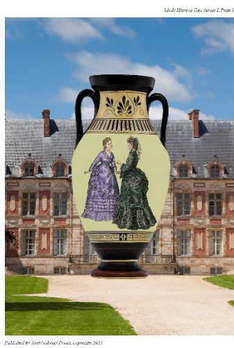
Print with Background