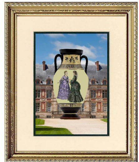
Print with Optional Mat and Frame