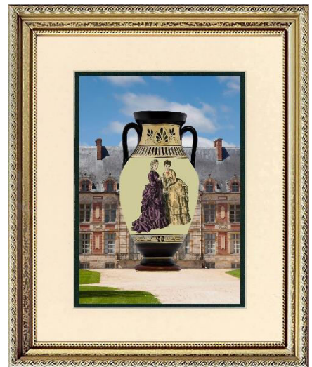
Print with Optional Mat and Frame