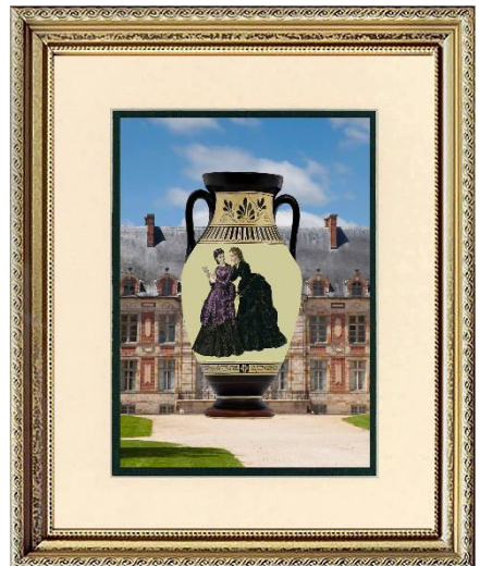
Print with Optional Mat and Frame