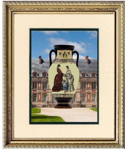
Print with Optional Mat and Frame