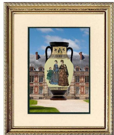
Print with Optional Mat and Frame