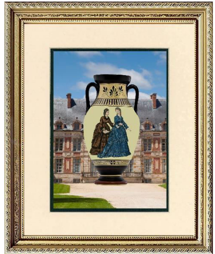
Print with Optional Mat and Frame