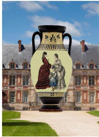
Print with Background