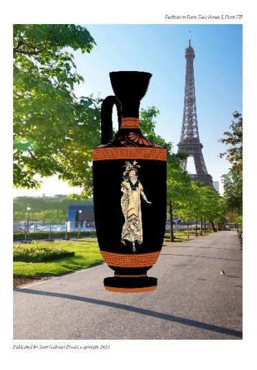
Print with Backgrounf