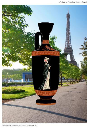
Print with Background