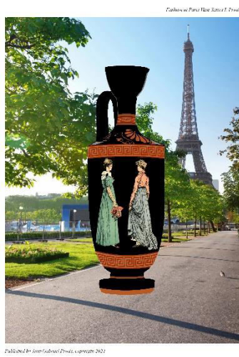
Print with Background