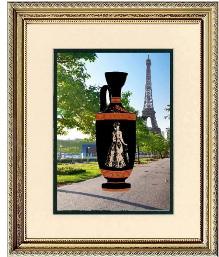
Print with Optional Mat and Frame