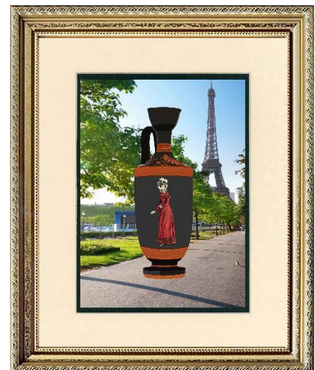
Print with Optional Mat and Frame