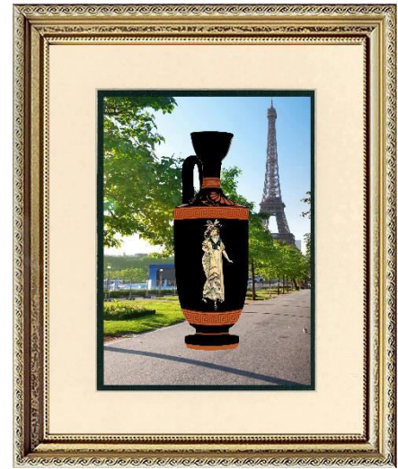
Print with Optional Mat and Frame