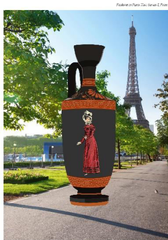
Print with Background