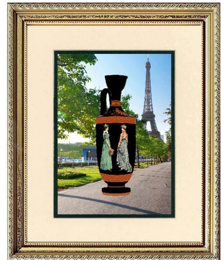
Print with Optional Mat and Frame