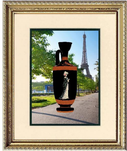
Print with Optional Mat and Frame