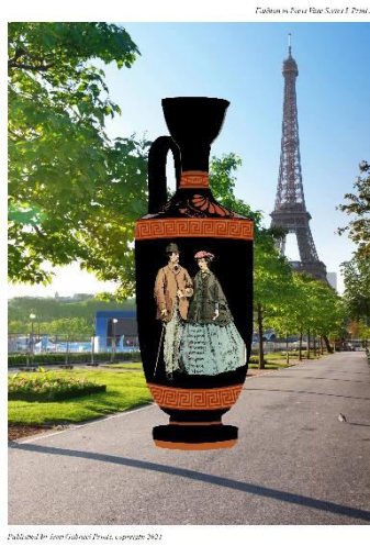
Print with Background