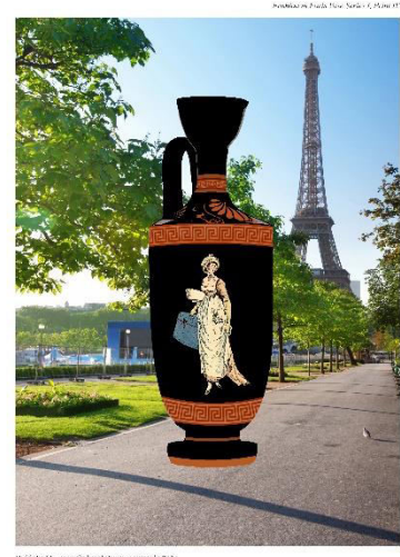
Print with Optional Mat and Frame