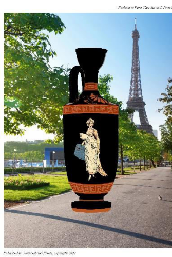
Print with Background