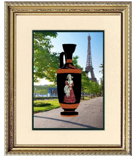
Print with Optional Mat and Frame