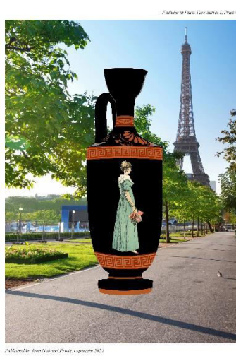
Print with Background