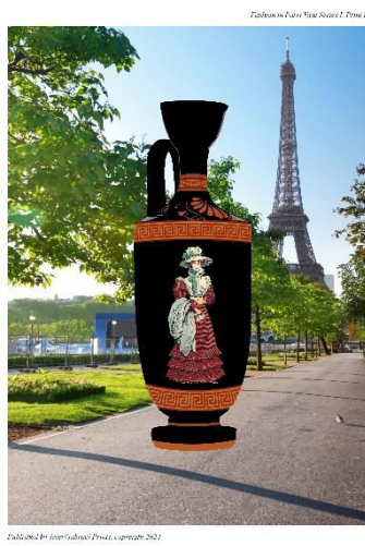
Print with Background