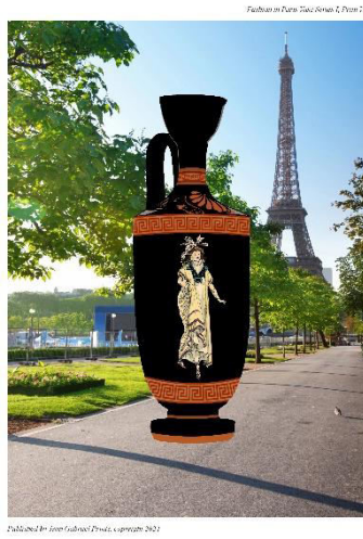
Print with Background