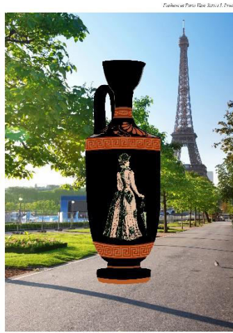
Print with Background