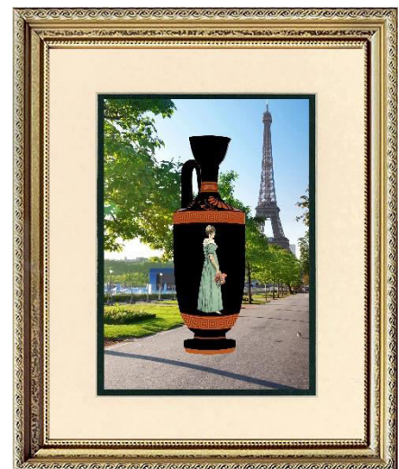
Print with Optional Mat and Frame