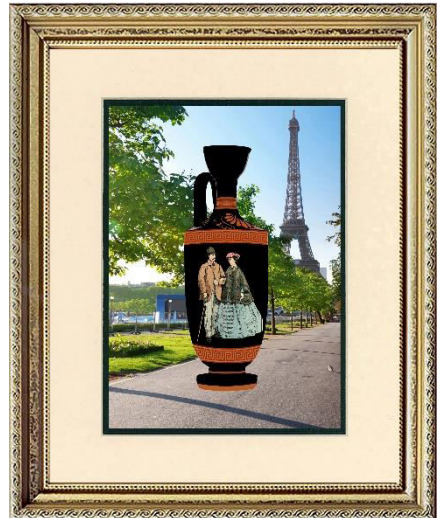
Print with Optional Mat and Frame