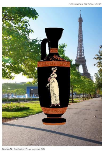
Print with Background