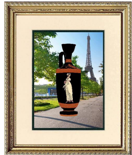
Print with Optional Mat and Frame