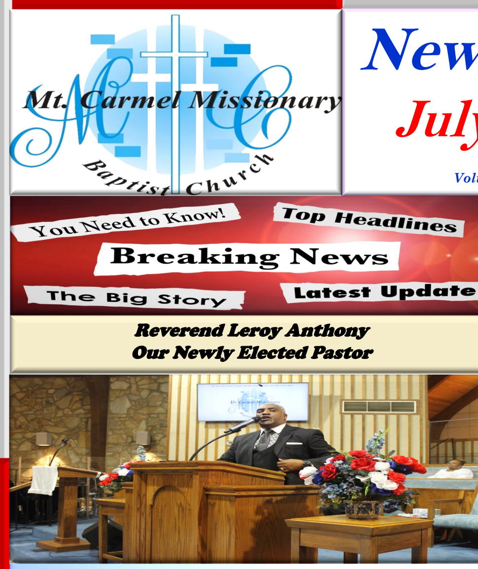
"I love the word of God. My favorite passage of scripture is Psalms 1. This is all I know to do. This is who I am. I Love the word of God."

Blessed is the man that walketh not in the counsel of the ungodly, nor standeth in the way of sinners, nor sitteth in the seat of the scornful.