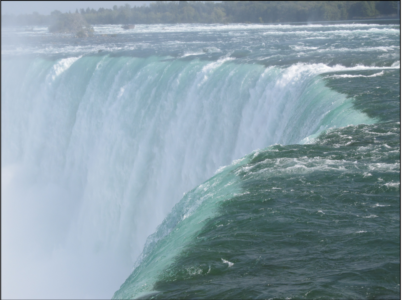
Niagara Falls, Canadian side Leics. FF exchange to Hamilton, September 2016