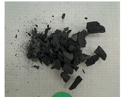
1059.0mg analyzed (1mm x 1mm scale)

Disclosures: All work was done at Beta Analytic in its own chemistry lab and AMSs. No subcontractors were used. Beta's chemistry laboratory and AMS do not react or measure artificial C 14 used in biomedical and environmental AMS studies. Beta is a C14 tracer-free facility. Validating quality assurance is verified with a Quality Assurance report posted separately to the web library containing the PDF downloadable copy of this report.