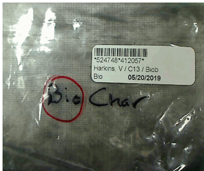
Package received - labeling COC

Laboratory Number Beta-524748 Percent modern carbon (pMC) 113.35 +/- 0.22 pMC Atmospheric adjustment factor (REF) 100.0; = pMC/[1/(100.0/112)]