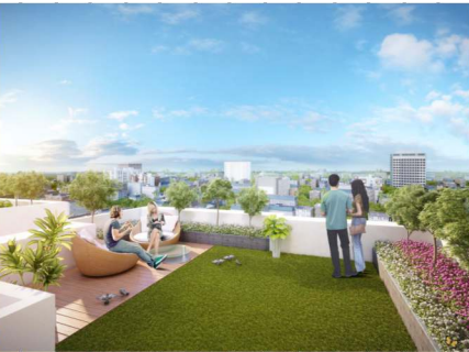
ROOFTOP SEAT OUT