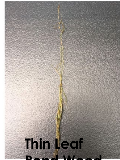
Thin Leaf Pond Weed