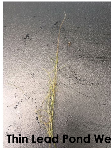
Thin Lead Pond Weed or Water Naiad