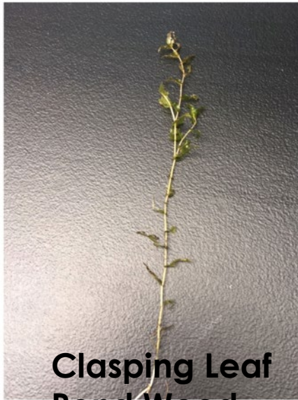
Clasping Leaf Pond Weed