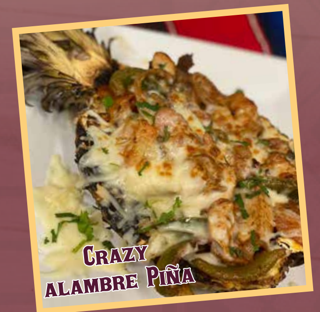
CRAZY ALAMBRE PIÑA