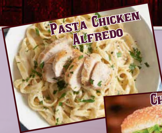
PASTA CHICKEN ALFREDO

Shrimp, chicken, bacon, mushrooms, Alfredo sauce, parmesan cheese and bread 19.49