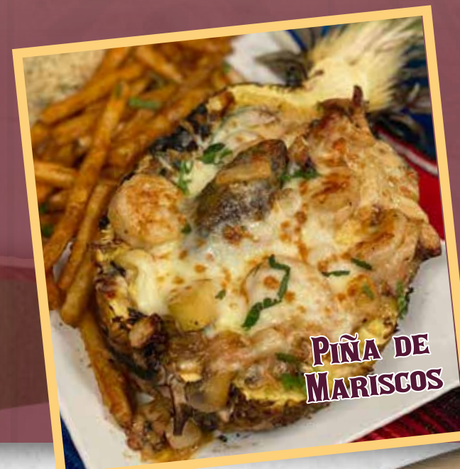
PIÑA DE MARISCOS

Pineapple stuffed with shrimp, octopus, imitation crab, mushrooms, pineapple, bacon, house cream and melted cheese. Served with white rice, bread, salad and French fries. 25.99