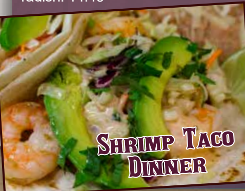
SHRIMP TACO DINNER

3 Big corn tortilla tacos, chorizo sausage, steak, grilled onions, guacamole, cucumber, and radish. 14.49