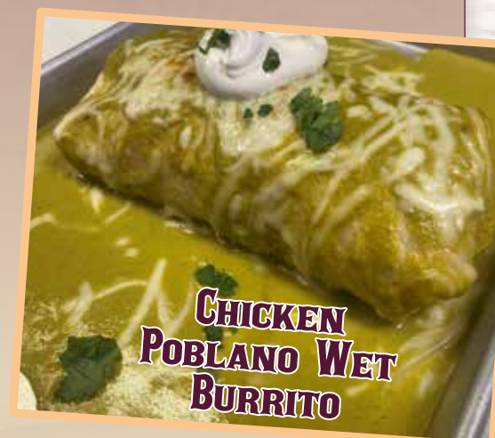
CHICKEN POBLANO WET BURRITO

14" Flour tortilla rice and beans, steak, chicken, pineapple, chorizo, shrimp, queso dip. 16.99