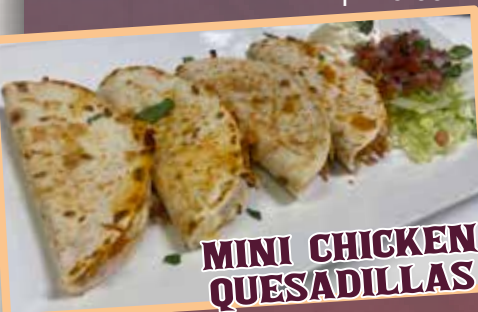
MINI CHICKEN QUESADILLAS