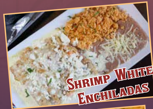
SHRIMP WHITE ENCHILADAS