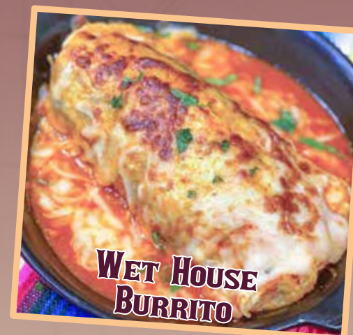
WET HOUSE BURRITO