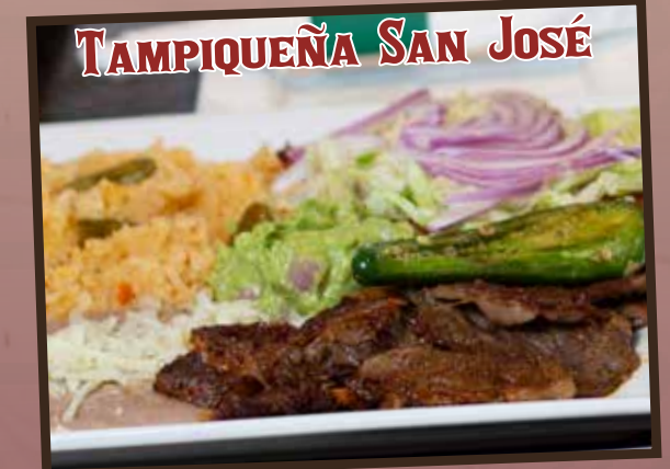
TAMPIQUEÑA SAN JOSÉ