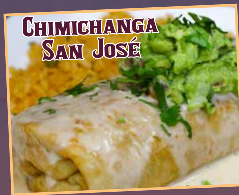
CHIMICHANGA SAN JOSÉ