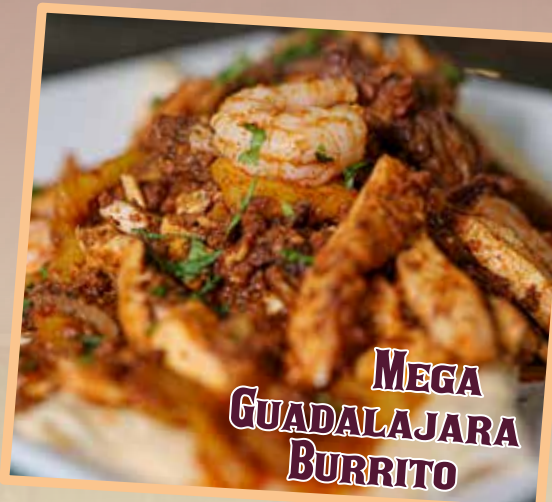
MEGA GUADALAJARA BURRITO