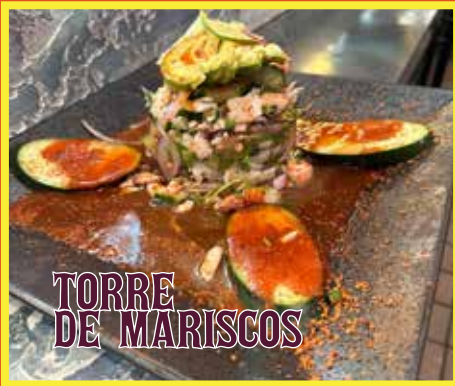
TORRE DE MARISCOS