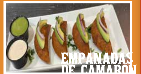
EMPANADAS DE CAMARON