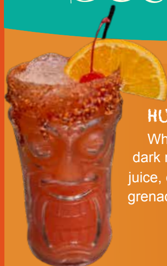
HURACÁN White rum, dark rum, lime juice, orange juice, grenadine $13.99