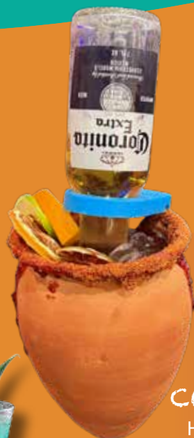
CORONARITA House margarita and corona beer. $17.99