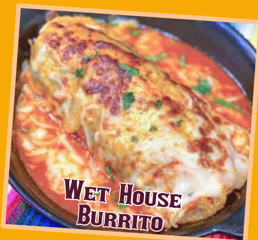
WET HOUSE BURRITO