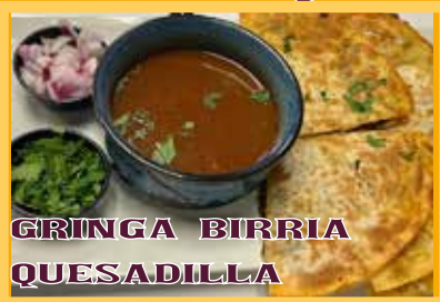
GRINGA BIRRIA QUESADILLA