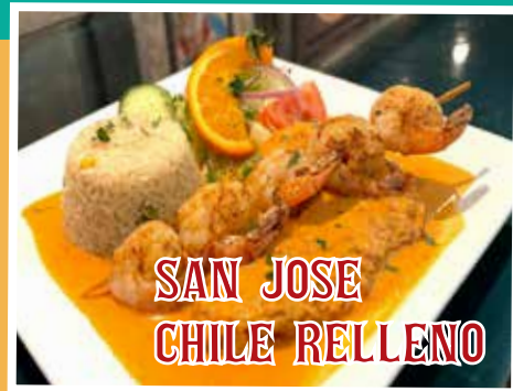
SAN JOSE CHILE RELLENO

Simmered pork skin, and neck. Served with rice and beans, pico de gallo, hot salsa, tortillas. 18.99