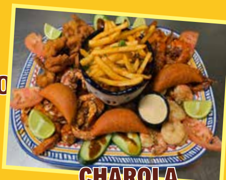
CHAROLA SAN JOSE

MOJARRA FRITA Mojarra frita 24.99 Al Mojo de ajo | zarandiada, ala Diabla EXTRA 3.99