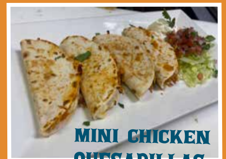
MINI CHICKEN QUESADILLAS