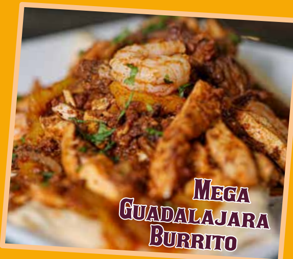
MEGA GUADALAJARA BURRITO

14" Flour tortilla rice and beans, steak, chicken, pineapple, chorizo, shrimp, queso dip. 16.99