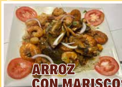
ARROZ CON MARISCOS