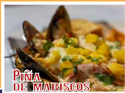
PIÑA DE MARISCOS