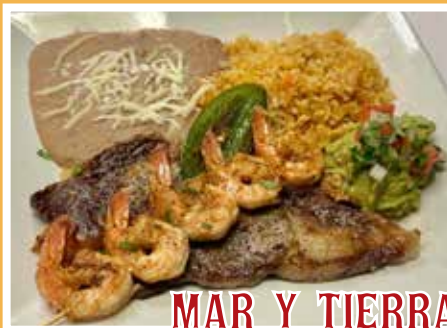
MAR Y TIERRA

Rib-eye steak, shrimp, guacamole, rice, beans and tortillas. 21.99