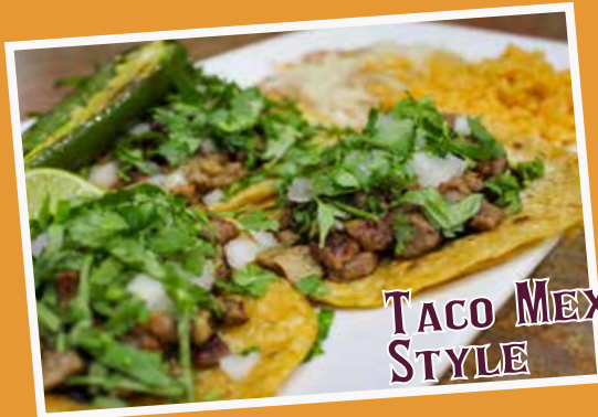
TACO MEXICAN STYLE