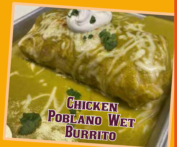
CHICKEN POBLANO WET BURRITO