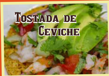
TOSTADA DE CEVICHE