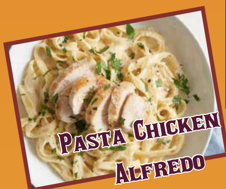
PASTA CHICKEN ALFREDO