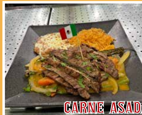
CARNE ASADA ALA MEXICANA