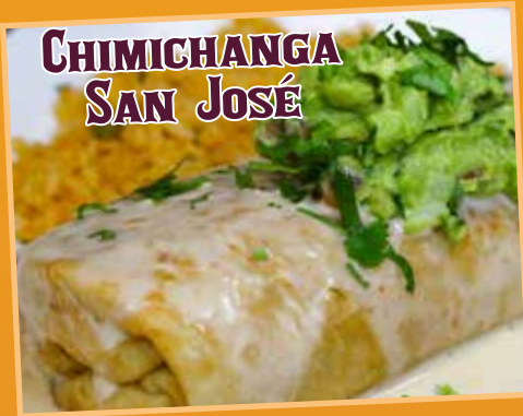
CHIMICHANGA SAN JOSÉ