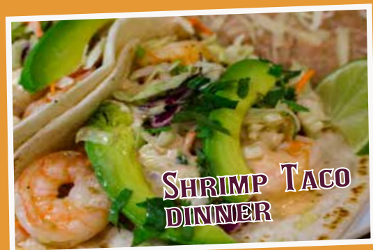
SHRIMP TACO DINNER