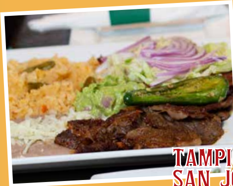
TAMPIQUEÑA SAN JOSE