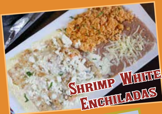
SHRIMP WHITE ENCHILADAS