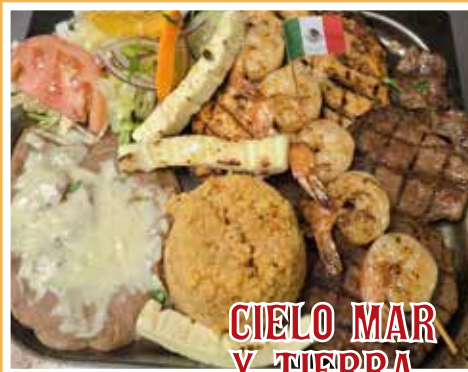
CIELO MAR Y TIERRA

Rin-eye steak, shirmp diabla, grilled chicken. Served white rice, beans, salad and tortillas. 26.99