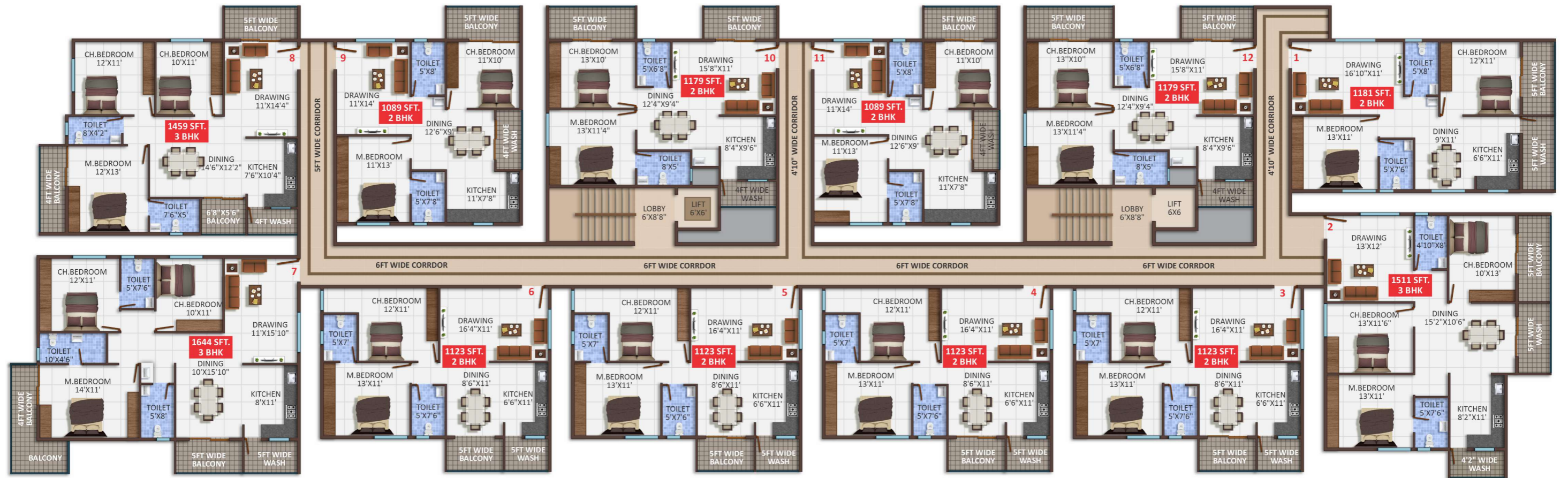
Typical Floor Plan Area Statement in SFT.