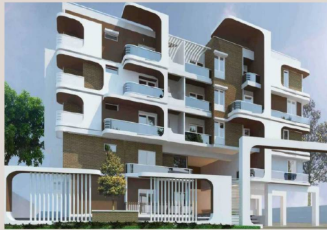
Advaita @ Yeshwanthpur