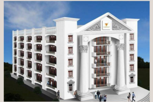
White Pearl @ Mysore Road