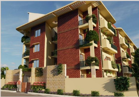
Agastya @ Tumkur Road