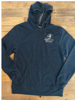
Micro-fleece Hoodie · $40