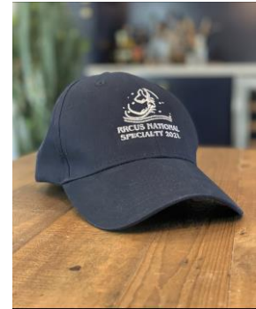
Logo Cap · $15