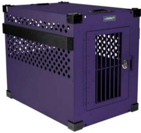
Impact Travel Crate 48" Long - $1200 Value