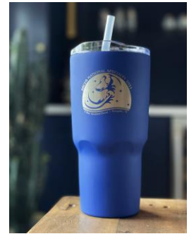
Insulated Tumbler · $25