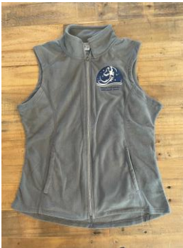
Women's Fleece Vest · $35