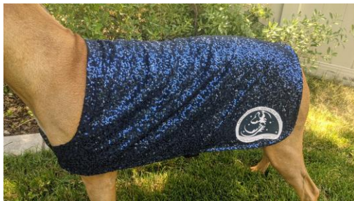
Navy Logo Cool Coats - $69 - $79-

Adjustable strap across the chest and under the belly.