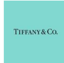
Tiffany & Co. $500 Gift Card