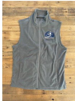
Men's Fleece Vest · $35