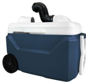
ICYBREEZE V2 PRO Portable Air Cooler