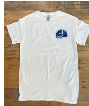
Logo Tee · $15