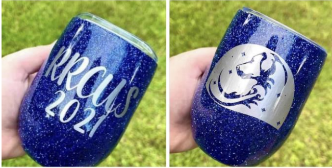
Insulated Wine Cup · $35