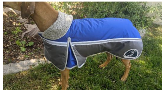
Double-lined Reflective Winter Coats - $92 - $107

Adjustable strap across the chest and under the belly.