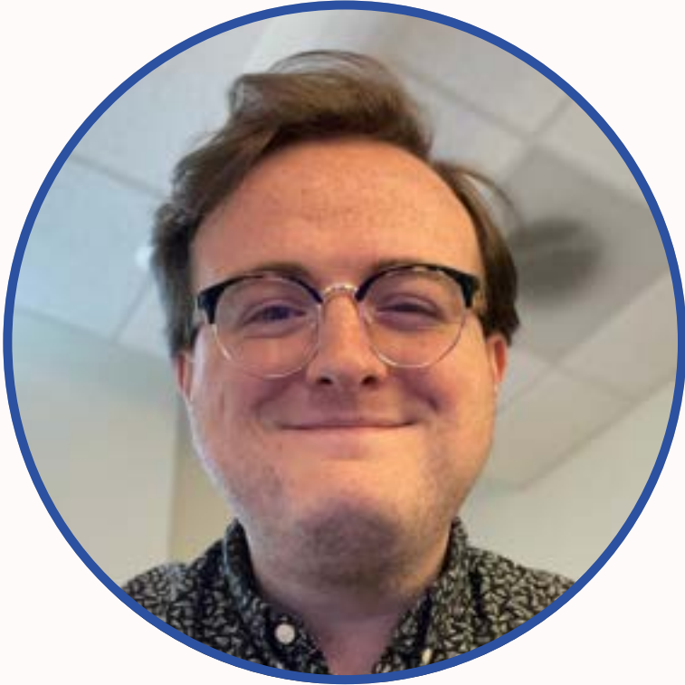
Bailey Morgan Chair