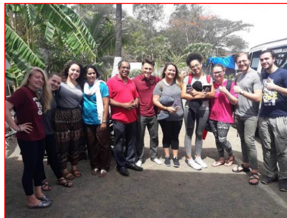
Mission Students from Southeastern University, Florida, USA