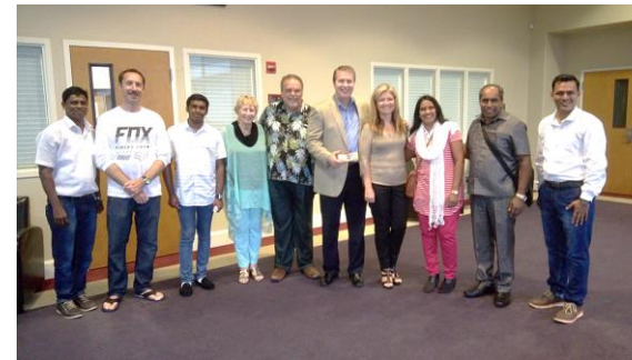
Ministering at The Sanctuary Church, Deland, Florida, USA