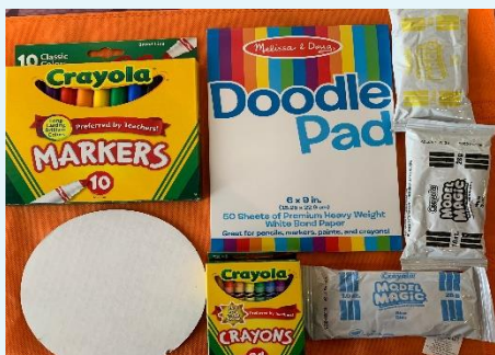
School Age Drawing Kit

Over the last few months, the Child Life and Creative Arts Therapy department has been distributing coping kits to each patient. Coping kits began during the height of COVID-19 as way to provide materials for patients on isolation, as well as decrease contact between patient. Each coping kit is carefully assembled based on age, developmental ability and interests for each patient. Pictured are the three coping kits currently used for patients referred to art therapy services that are provided during introduction to services.