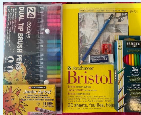
Adolescent Watercolor Kit

Follow us and see exciting things happening every day!