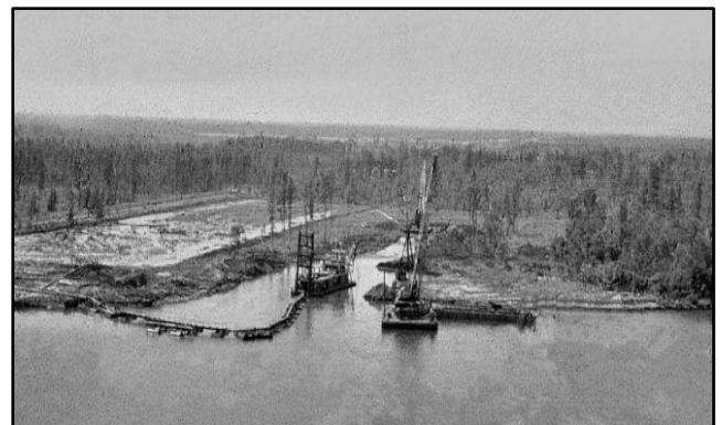
The berth for Battleship North Carolina is dredged in anticipation of an October 1961 Wilmington arrival.