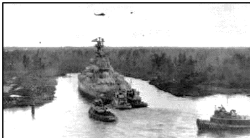
Oct. 2, 1961 - Battleship North Carolina is nudged into position at her new Wilmington home.