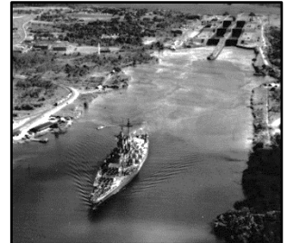
Oct. 11, 1945 - The Showboat transits the Panama Canal.

In October 1945 , with the war having ended the month before, the Showboat was headed home. Passing through the Panama Canal on October 11 , USS North Carolina arrived to a hero's welcome in Boston on October 17 .