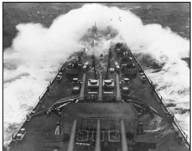
The Showboat continues taking water over the bow after emerging from a typhoon off the Philippine Islands.

Task Force 38 emerged from the storm to find that three destroyers, USS Hull (DD-350), USS Monaghan (DD-354), and USS Spence (DD-512), had been lost along with nearly 800 men. At least 30 other ships sustained damage to some extent with nine requiring significant repairs before returning to the war effort. North Carolina made it through the storm with relatively minor damage and the loss of her Kingfisher aircraft which were washed over the side.