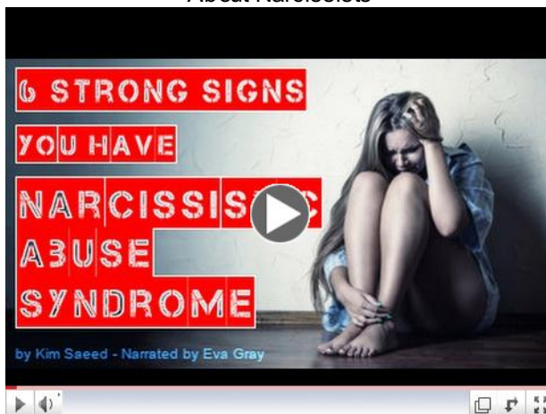
6 Strong Signs You Have Narcissistic Abuse Syndrome