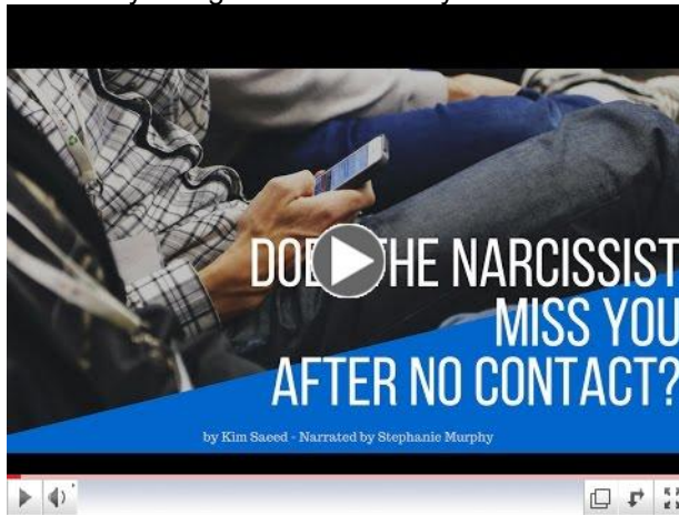
Does the Narcissist Miss You After No Contact?