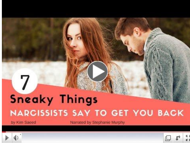
7 Sneaky Things Narcissists Say to Get You Back