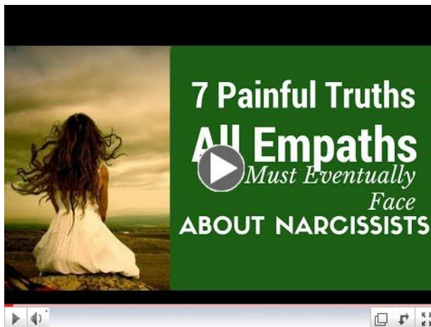
7 Painful Truths Empaths Must Eventually Face About Narcissists