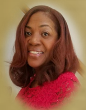
NDC GENERAL TREASURER Minister Angie HOLMAN