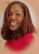
NDC GENERAL TREASURER Minister Angie HOLMAN