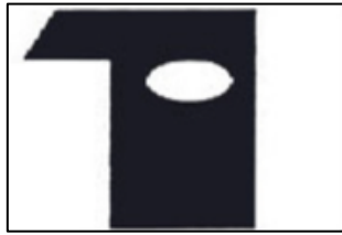
A hole in one