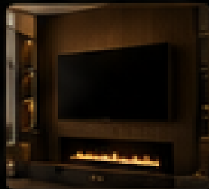
MOOD SLAT WARMTH