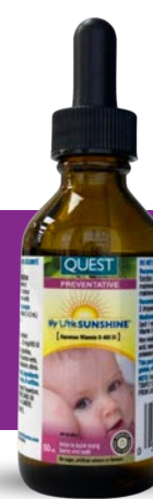
Quest® My Little Sunshine Aqueous Vitamin D 400 IU