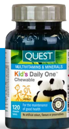
Quest® Kid's Daily One™ Chewable