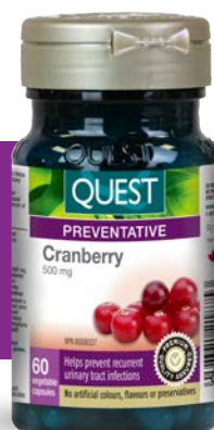
Quest® Cranberry Extract