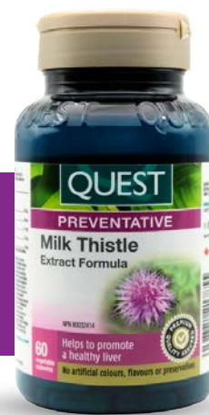
Quest® Milk Thistle Extract Formula