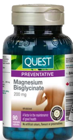
Quest® Magnesium Bisglycinate