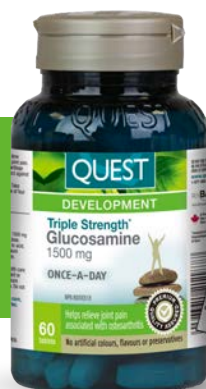
Quest® Triple Strength Glucosamine Sulfate