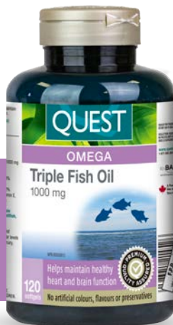
Quest® Triple Fish Oil