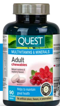
Quest® Adult Chewable Multivitamin