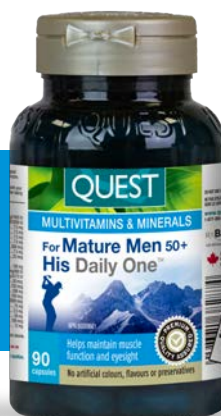
Quest® His Daily One™ for Men 50+