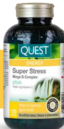
Quest® Super Stress B + C