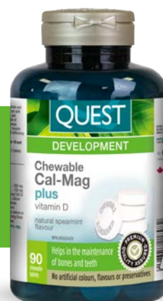
Quest® Cal-Mag Chewable