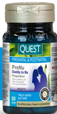
Quest® Daddy To Be - Preparation