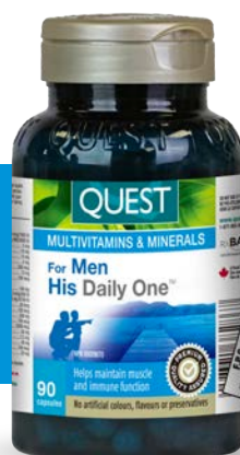
Quest® His Daily One™ for Men