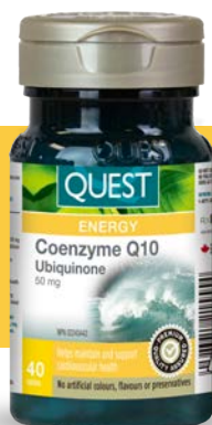
Quest® Coenzyme Q10 Ubiquinone