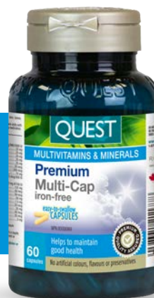
Quest® Premium Multi-Cap Iron Free