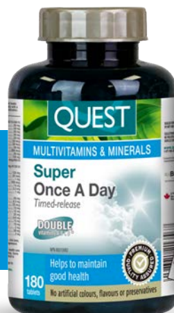
Quest® Super Once A Day Timed- release