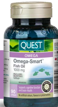
Quest® Omega Smart