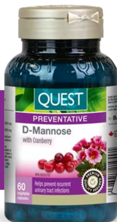
Quest® D-Mannose with Cranberry