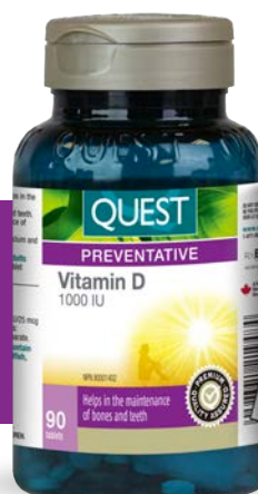
Quest® Vitamin D3 1000 IU