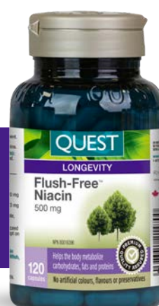
Quest® Flush-Free™ Niacin