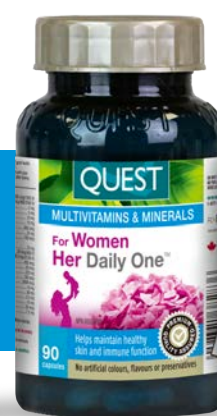
Quest® Her Daily One™ for Women