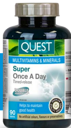
Quest® Super Once A Day Timed- release