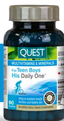
Quest® His Daily One™ for Teen Boys