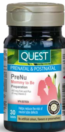
Quest® Mommy To Be - Preparation