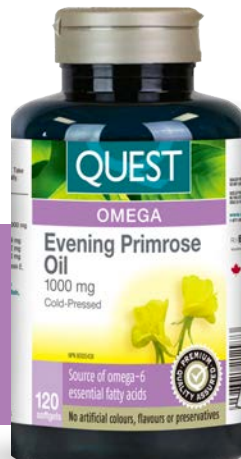
Quest® Evening Primrose Oil