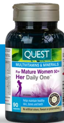
Quest® Her Daily One™ for Mature Women 50+