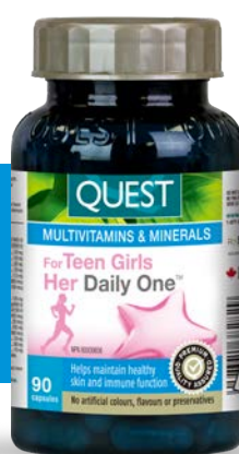
Quest® Her Daily One™ for Teen Girls