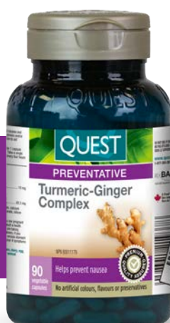
Quest® Turmeric-Ginger Complex