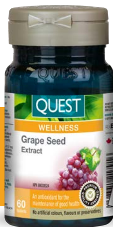
Quest® Grape Seed Extract