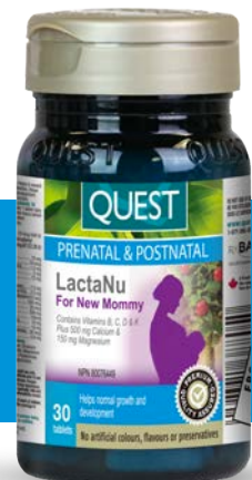
Quest® LactaNu for New Mommy