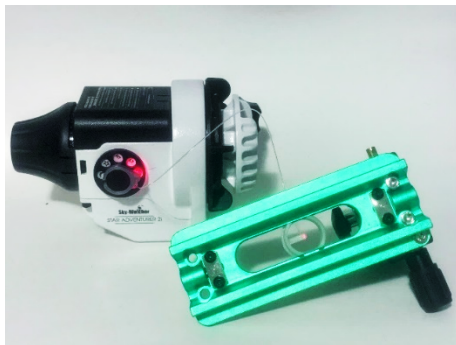
Emitter installed into dovetail slot