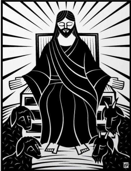
The Sheep and the Goats

40 “The King will reply, ‘Truly I tell you, whatever you did for one of the least of these brothers and sisters of mine, you did for me.’