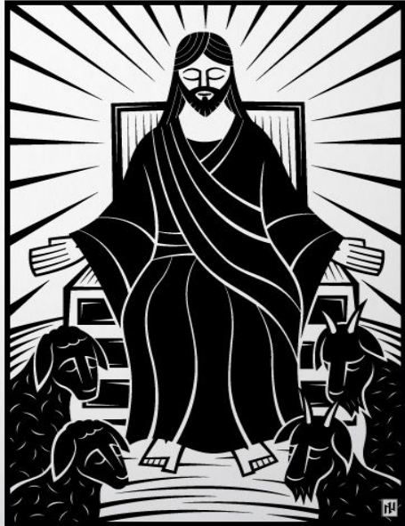
The Sheep and the Goats

44 “They also will answer, ‘Lord, when did we see you hungry or thirsty or a stranger or needing clothes or sick or in prison, and did not help you?’