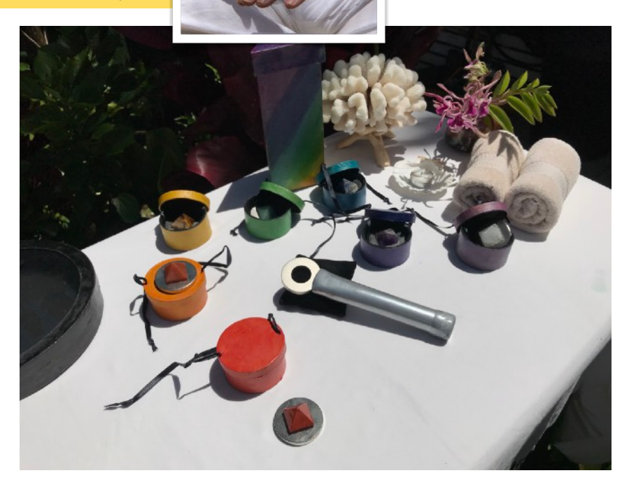
fig. 3. Pictured: The DEEMS Device shown with optional 7 Healing Crystal Heads, (sold separately). See www.LightLoveMedia.com for details and purchasing options. *The DEEMS Device comes as shown with ring magnet only.

The optional 7 Healing Crystal Heads can be used to focus these energies and work more deeply and directly with the body and meridians/energy centers to bring a greater healing, balancing and awakening to the user as well as the practitioner of energy work.