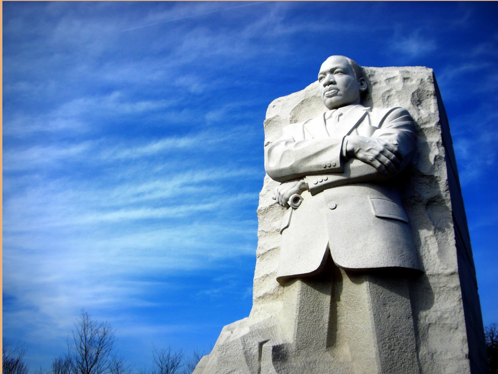
Martin Luther King, Jr. Memorial