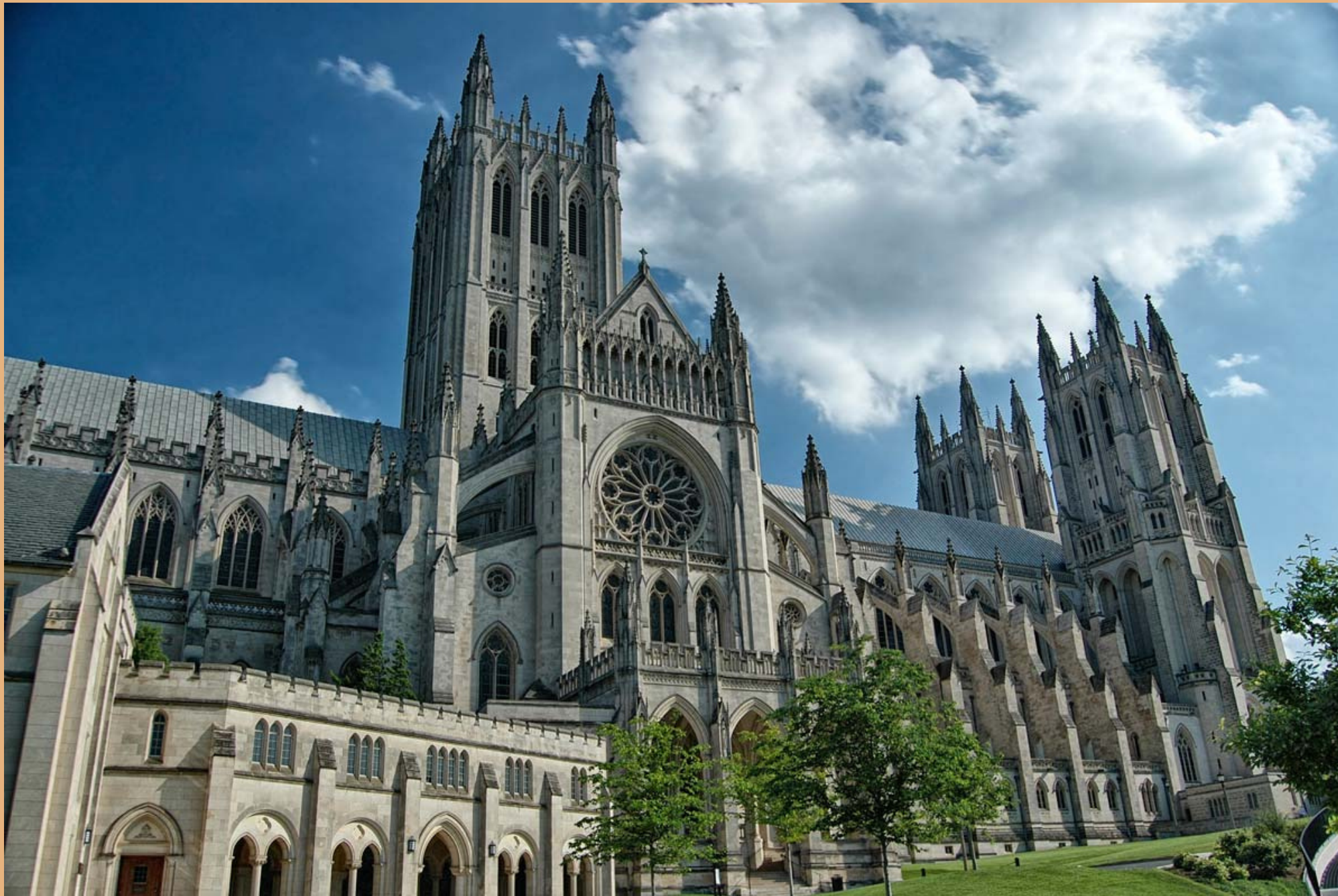
Washington National Cathedral