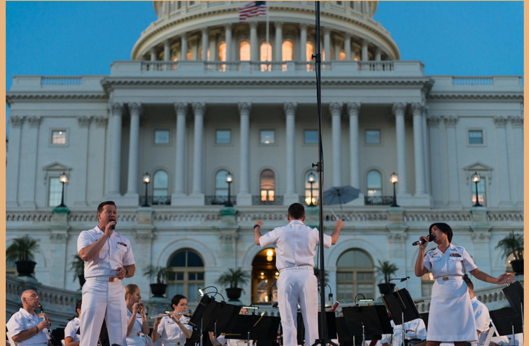
US Navy Band in concert