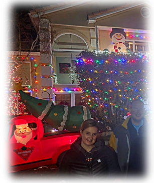
Sunday, Dec 13