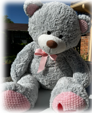
Saturday, June 6