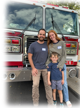
Saturday, August 29