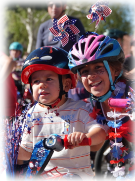
Saturday, July 4