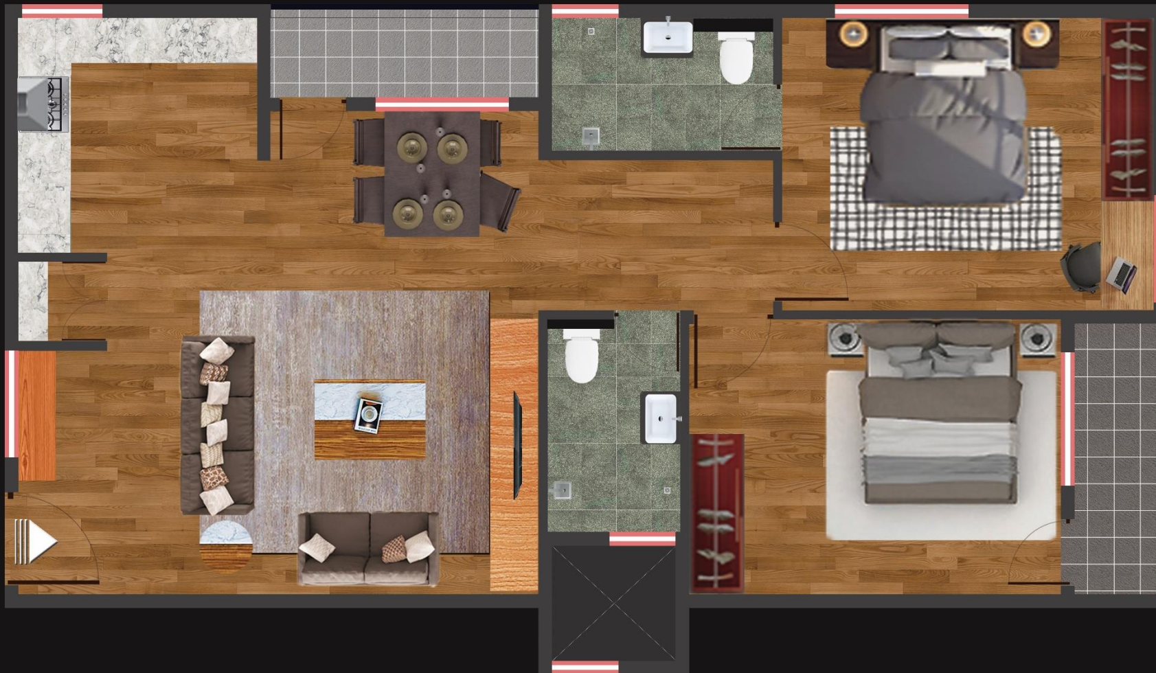
Flat C East Facing 1118 sqFT