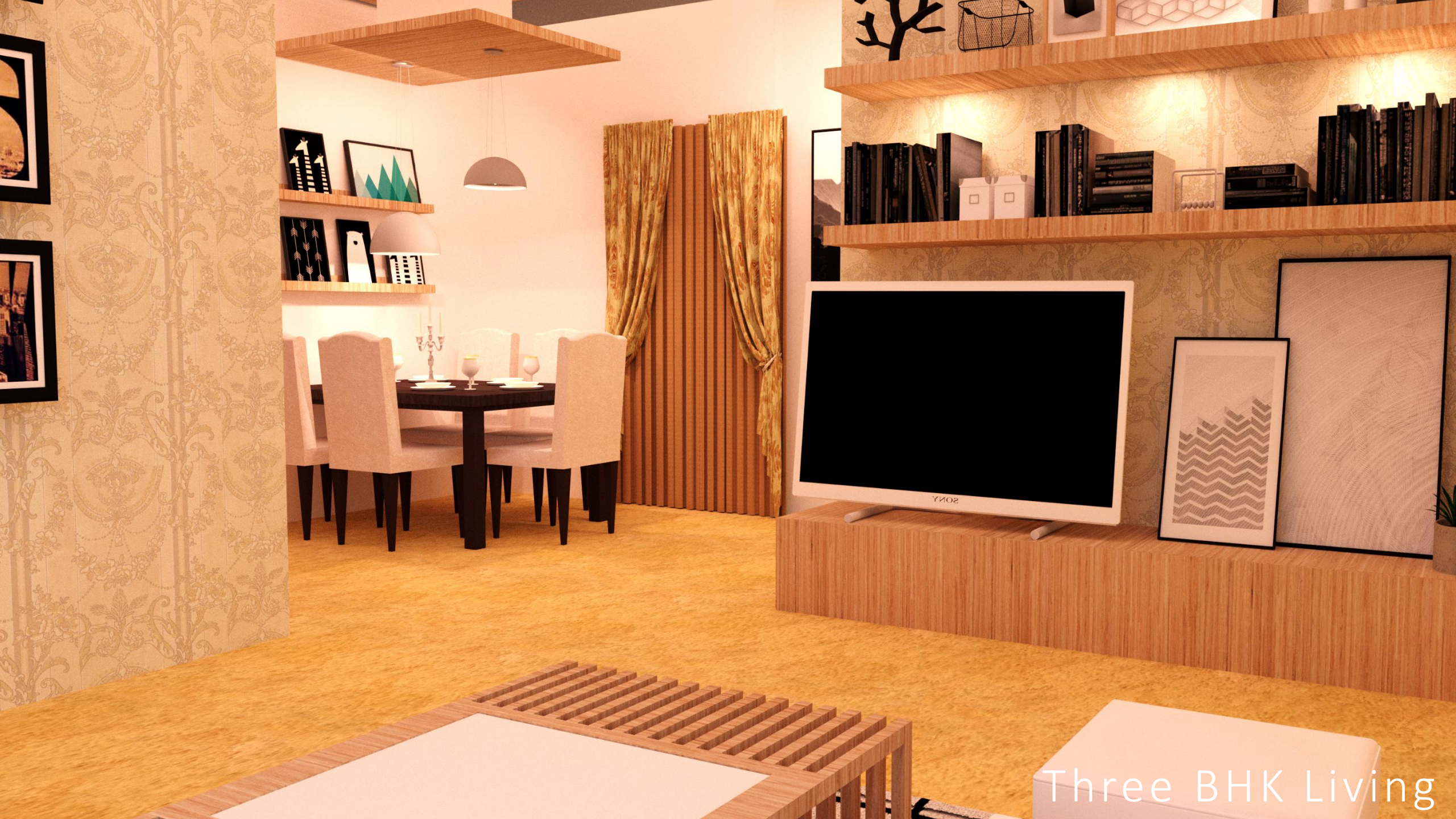
Three BHK Living